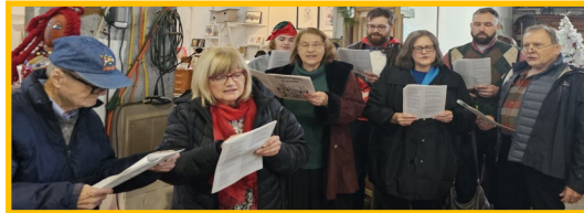
Singing at Art Port