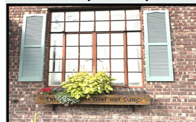
A change in color!