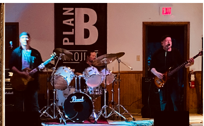
Now: Plan B